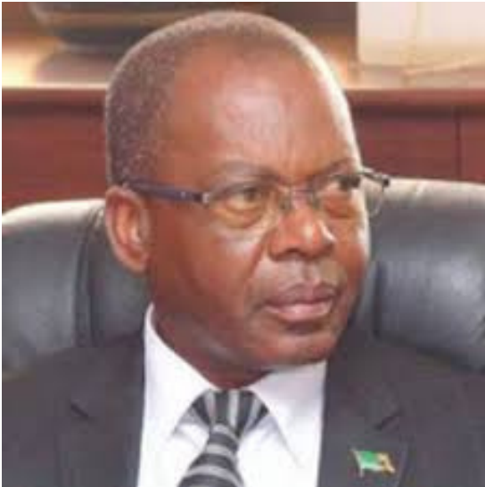
Honorable Matthew Nkhuwa Minister of Energy Republic of Zambia

Honorable Matthew Nkhuwa was appointed Minister of Energy by President Edgar Lungu of the Republic of Zambia. Prior to his becoming Minister of Energy, he served as Minister of Works and Supply. Honorable Matthew Nkhuwa is also a Member of Parliament for Chingola on the Copperbelt. In that capacity he has served on various parliamentary committees including the committee on legal affairs, Human Rights, National Guidance, Gender and Governance.